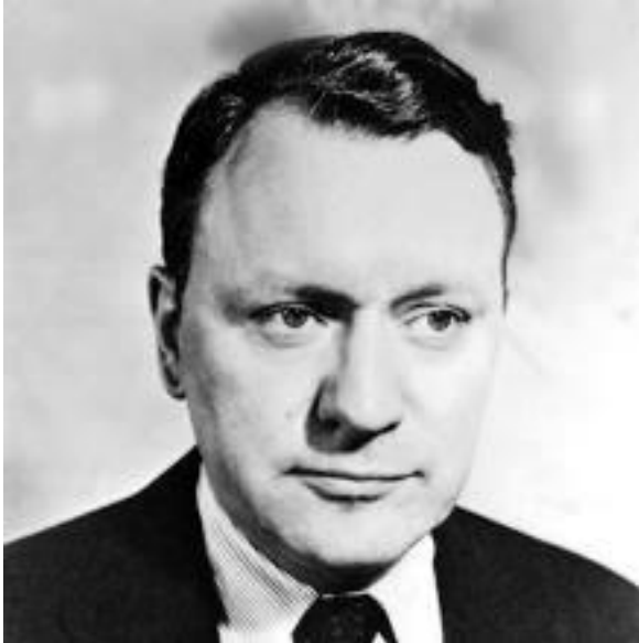
James Barrett ('Scotty') Reston (1909–95)

and which are now praised as so felicitous, had failed, historians would see in the execution of their originators the deserved punishment of major criminals’ (from an essay entitled ‘That May Be All Right in Theory, But It Does Not Work in Practice’, 1793). 223