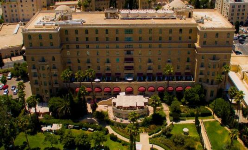
King David Hotel, Jerusalem