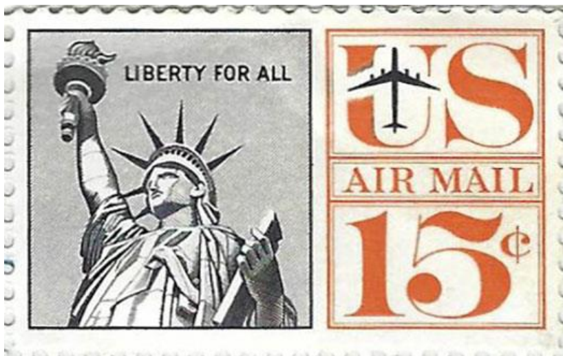
The stamp on the envelope for the second letter of 2 December 1963 (below)

[ PS on back of envelope ] 11·45 am London time: I've got over it. no scars. я тебя люблю – that is why all is so well . I look forward 'ОЧЕНЬ' to our "free" ХОЛИДАЙ ТУГЕЗЗЕР, ЭЛОУН. 88