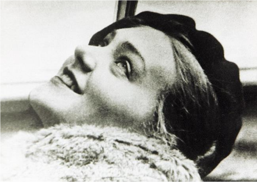
Olga Ivinskaya in 1937